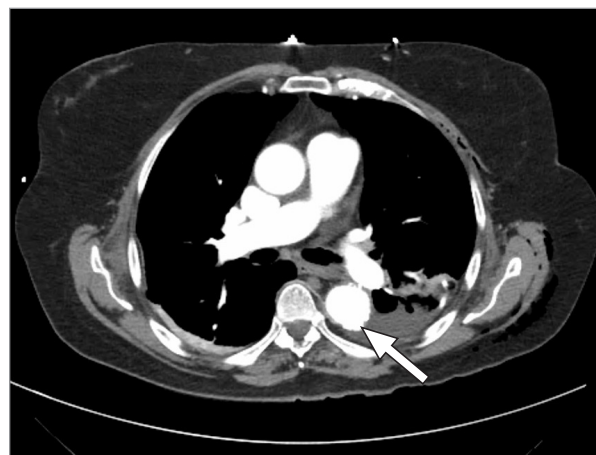
Fig. 3 A computed tomography angiography axial image shows the penetrating aortic ulcer (arrow). The penetrating aortic ulcer was not reported to be of clinical significance. There was no associated hematoma. Post hoc measurement of ulcer depth was roughly 6 to 7 mm from the intimal surface, and penetrating aortic ulcer diameter was 1.8 cm.