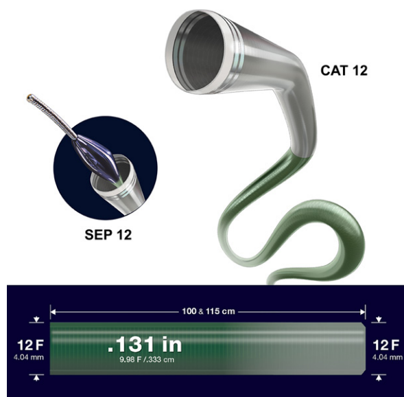
Fig. 2 Shown are the CAT 12 catheter, the Separator 12 (SEP 12), and catheter specifications.

The final component of the Lightning 12 system is the CAT 12 catheter (Fig. 2). This unique, multipitch, laser-cut hypotube enables improved torque response from tip to base. It has an inner diameter of 0.131 inches (0.333 cm) and comes in 2 lengths (100 and 115 cm). Multiple polymer transitions increase flexibility and trackability at an atraumatic tip, with back-end support. The catheter's unique primary and secondary curve combination is highly suited for tracking PA tortuosity, including the acute angle of the left main PA. Moreover, a large Tuohy-Borst valve (diameter, 0.131 in) prevents a choke point in the aspiration system. An optional separator (SEP 12), consisting of a polymer bead attached to a robust wire, can be used to break