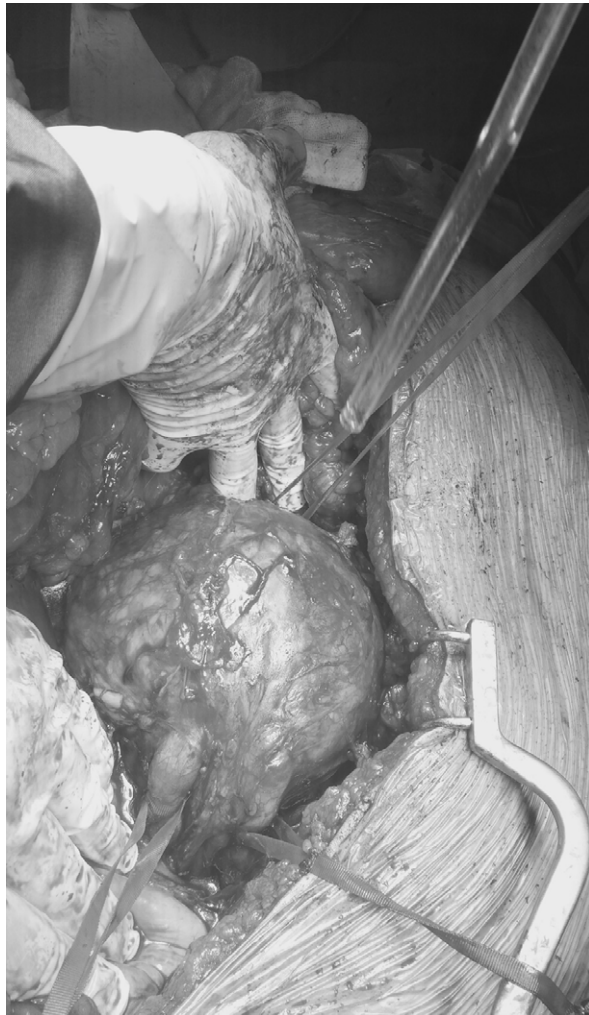
Fig. 3 Intraoperative photograph shows the infrarenal aortic aneurysm.