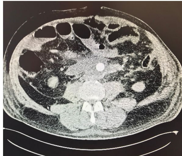
Fig. 4 Postoperative computed tomographic angiogram (transverse view) of the infrarenal aorta shows no vascular complications.

infrarenal neck. 14 Although the aneurysmal neck in our patient was long, the position of the AAA necessitated our gaining control of the supraceliac aorta. To protect the kidneys from ischemia, cross-clamping the supraceliac aorta is not recommended unless there is uncontrolled hemorrhage. Profuse venous bleeding from the opened aorta can be controlled by compressing the IVC or by using occlusive balloons. 15 Alternatively, hemostasis can be achieved by ligating the infrarenal IVC, iliac veins, or both. 16