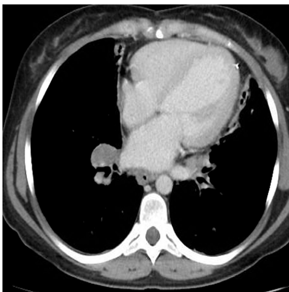
Fig. 3 Six months postoperatively, a computed tomogram shows no patch deterioration or lost integrity of the atrial wall.

To our knowledge, this is the first reported cardiac sarcoma resection involving extensive right atrial reconstruction with use of the MatriStem acellular porcine urinary bladder membrane. Whereas we have typically reconstructed atrial tissue with the use of bovine pericardial patches, 1,2 we have begun using the MatriStem membrane because of its potential benefits in the remodeling of cardiac tissue: porcine urinary bladders and other extracellular-matrix scaffolds have been shown to promote tissue growth while providing strong