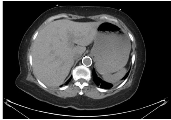
Fig. 4 Computed tomogram shows the intra-aortic stent.

Clinical presentation depends on the location of the lesion. Patients can present with severe hypertension, headache, mesenteric ischemia, and (as in our patient)