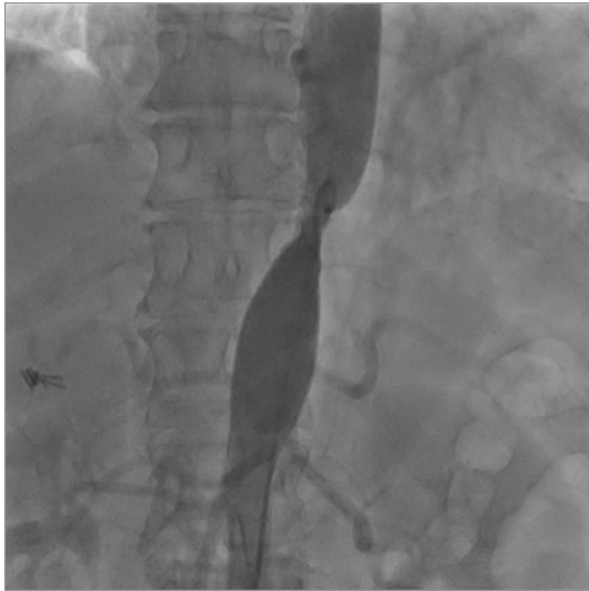
Fig. 2 Abdominal aortogram reveals an aortic pressure gradient >100 mmHg before and after the stenosis.