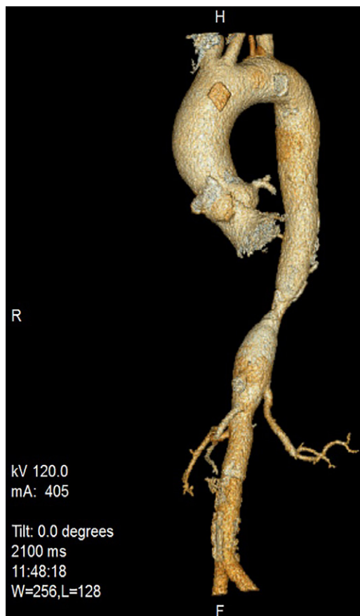
Fig. 1 Computed tomographic reconstruction shows a single discrete narrowing of the descending aorta above the celiac trunk and renal arteries.